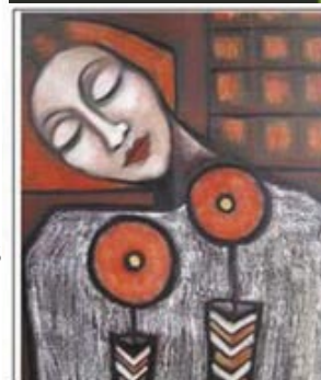
FIG TREE HILL ART STUDIO UNIQUE and BEAUTIFUL ARTWORKS